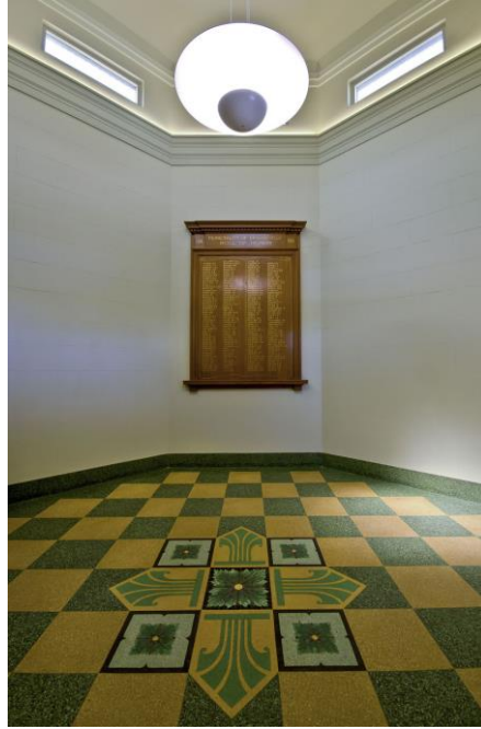
Erskineville Town Hall Honour Roll