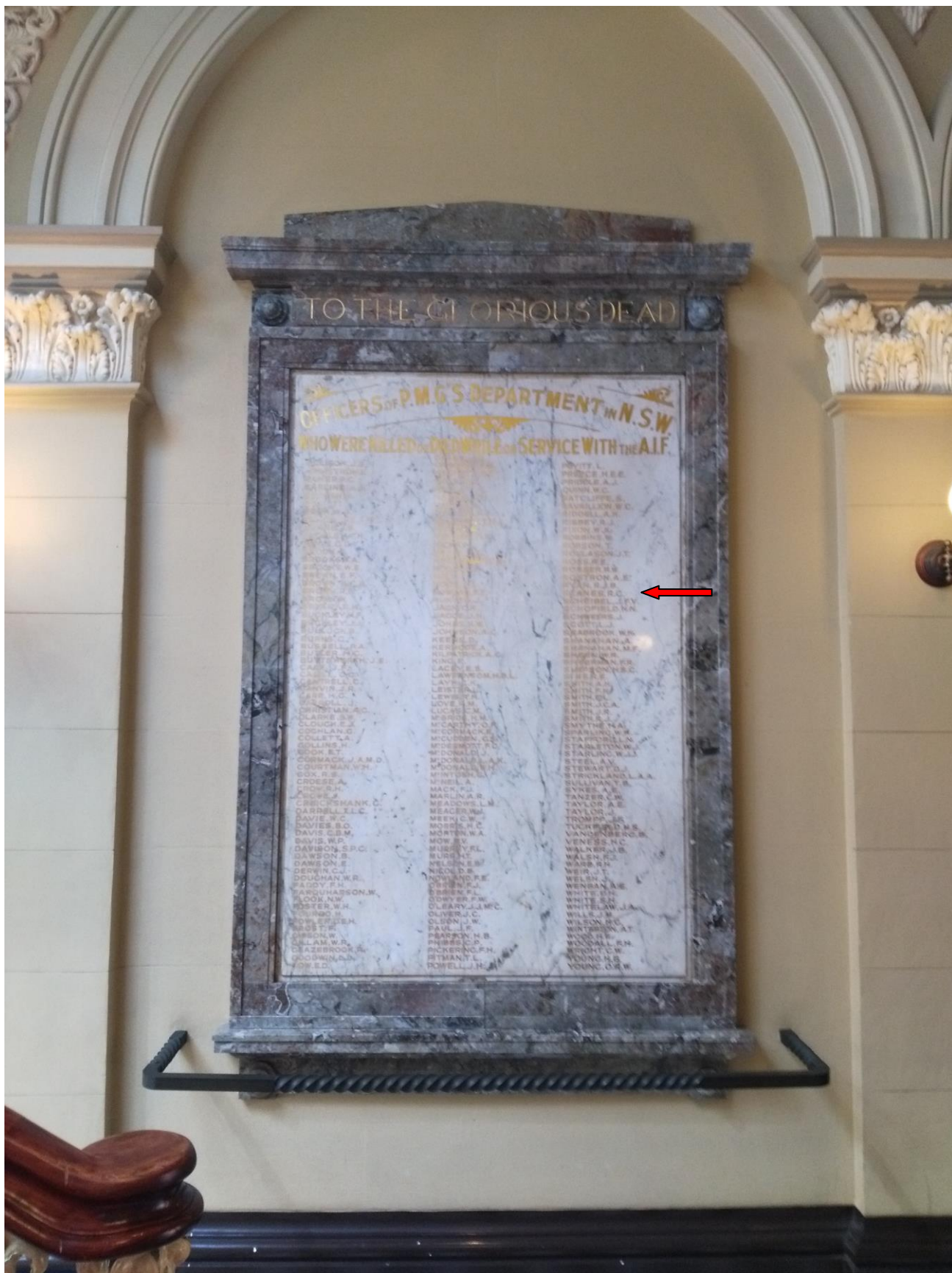
Postmaster General's Department in NSW Honour Roll